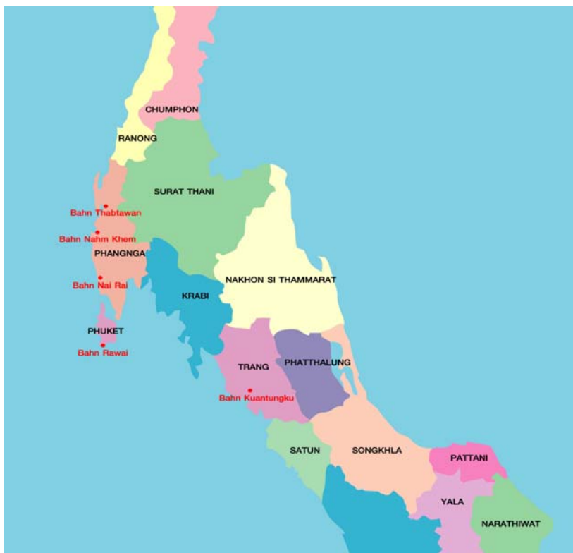
Map 1: Andaman coastal communities

marginalized and the poor in Thai Muslim, sea gypsy or Thai Buddhist communities have been affected by land conflicts.