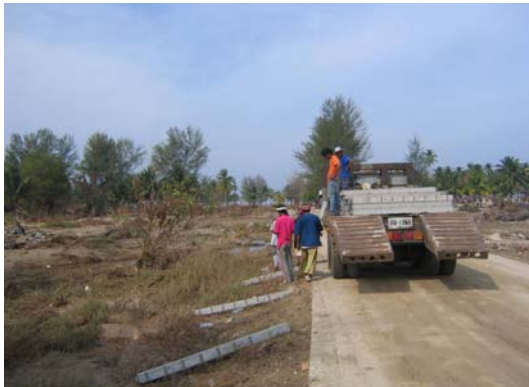
Picture 1: Three days after the Tsunami, developers sent in teams of workers to fence off land

In the eyes of the developers, the Andaman coastal areas are just meant to benefit the tourists, places to escape from chaotic lives for some rest. However, for the villagers living along the Andaman Coast, it is all they have left of a life led for hundreds of years. The lands they live on are their lives. Legal documents and papers are now being used by others to claim ownership over their birthright. For the communities these legal papers mean nothing, they are just pieces of paper allowing developers from outside to grasp everything that belongs to them.