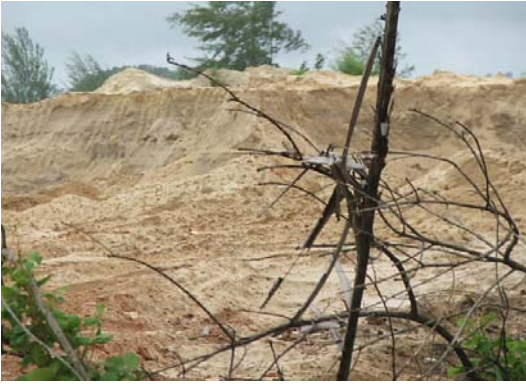
Picture 7: The sandy mine spoils caused by scooping soil during the mining process

One day at Bahn Thabtawan under the midday sun we suffered from the heat, which was partly reflected by the enormous hills of sandy mine spoils located behind the community. This is part of what is left over from the mining concessions of the past. Throughout the village, domestic pigs can be seen lying under the shade of trees or